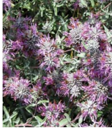
purple sage, Salvia leucophylla