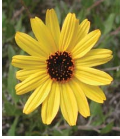
California sunflower, Encelia californica

Palos Verdes Peninsula Land Conservancy's mission is: