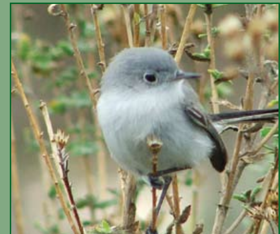
California gnatcatcher, Polioptila californica