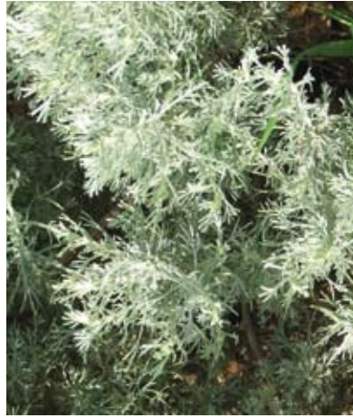
California sagebrush, Artemisia californica

Many of the plant communities and habitats found on the Reserve are representative of Southern California as it appeared before the arrival of Spanish settlers more than two centuries ago. California sagebrush, California sunflower, and purple sage are among the natives found within the scrublands.